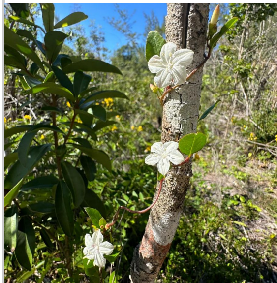
Pineland clustervine ( Jacquemontia curtissii )

IRC has an E-Trade account. Please contact us about giving gifts of stock.